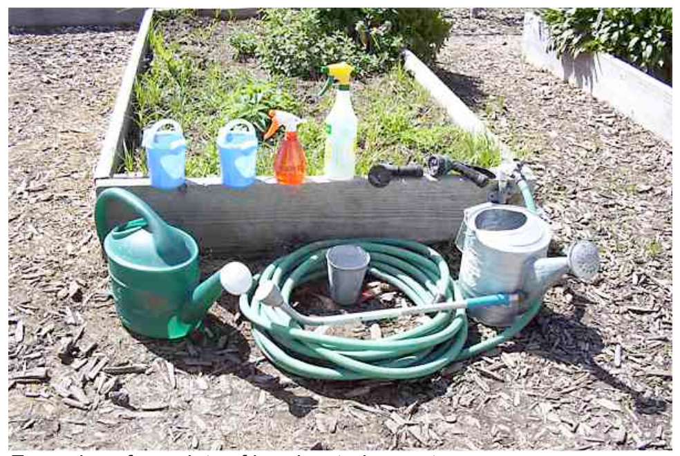
Examples of a variety of hand watering systems

Easy access to running water is essential. This can be as simple as a single hose faucet located in a convenient spot. Teachers may prefer to teach watering methods by use of watering cans or hoses. This gives students experience on how much and how often to water to obtain healthy crops. Hand watering is difficult during weekends, holidays, and vacations. Automated systems assist the teachers by eliminating the drudgery of hand watering when students are not available.