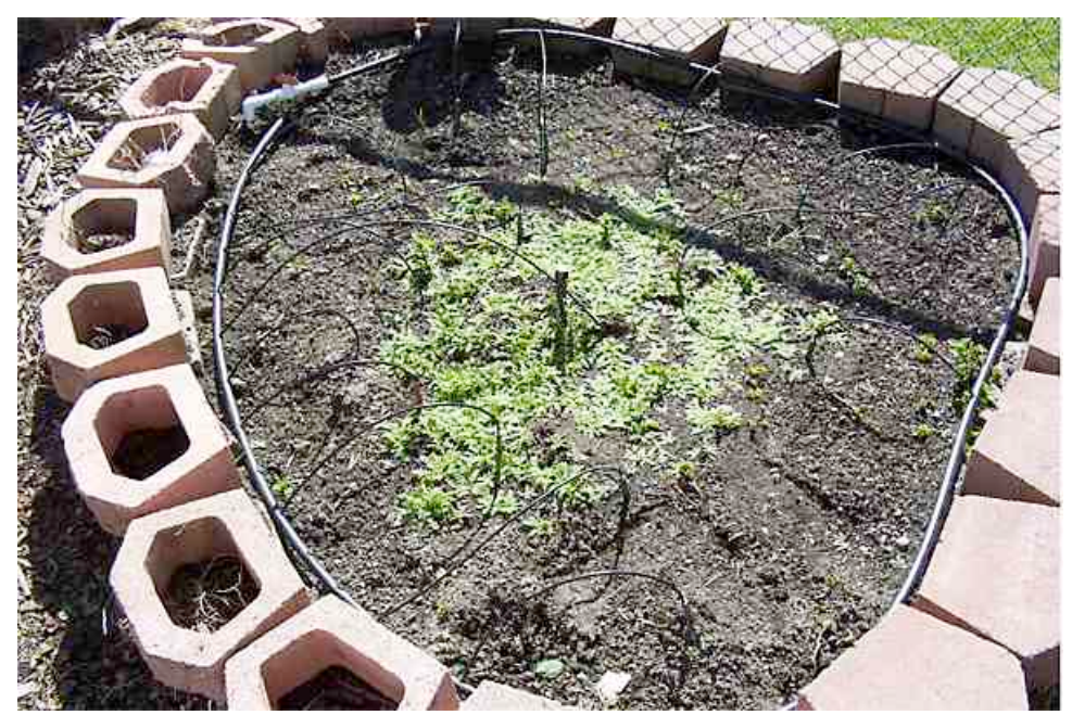
Example of a drip system

If an automated system is to be installed, consult with an irrigation specialist. Contact a parent volunteer knowledgeable in irrigation systems, or a local irrigation supply dealer to design and/or install a system. Free booklets describing irrigation system components are available from manufacturers and local retailers.